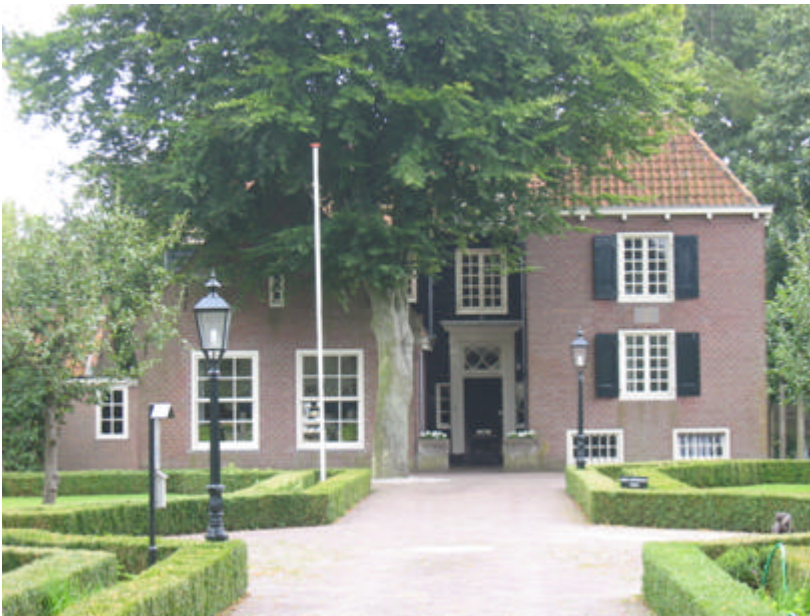
Herman Boerhaave's house