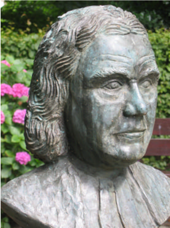
Herman Boerhaave (1668-1738)